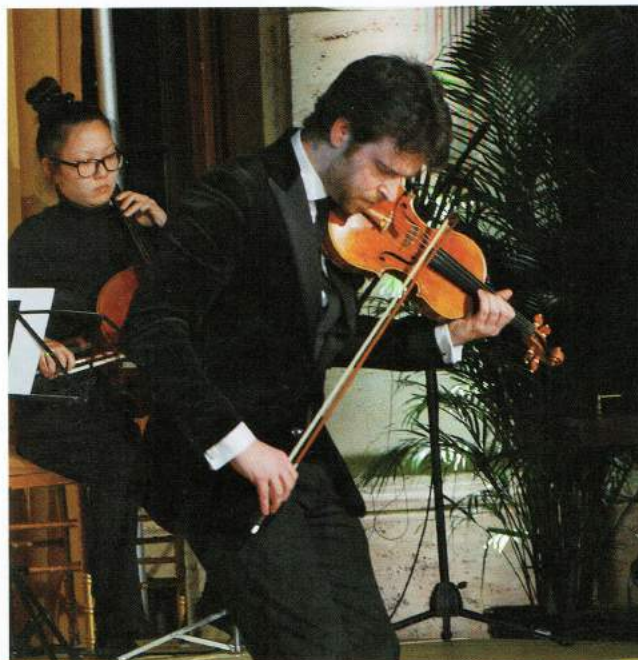
On February 11, the Emerald Isle dinner dance will be held at The Breakers at 7 p.m. The black-tie event will include a cocktail reception and an honoree presentation. For more information, call 212.213.1166.

4 MAKING STRIDES The Breast Cancer Research Foundation will celebrate its Hot